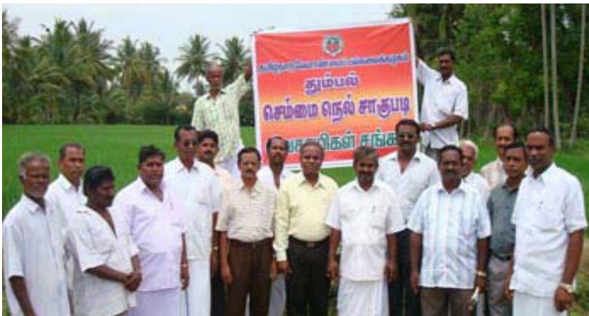
Thumal SRI Farmers Association