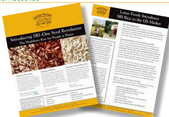
"Introducing SRI - One Seed Revolution - The Healthiest Rice for People and for the Planet"

undifferentiated supply pools that garner no premium price for farmers. Connecting SRI farmers to both domestic and export markets thus presents an important and novel opportunity to have significant economic and environmental impacts on smallholder rice communities.