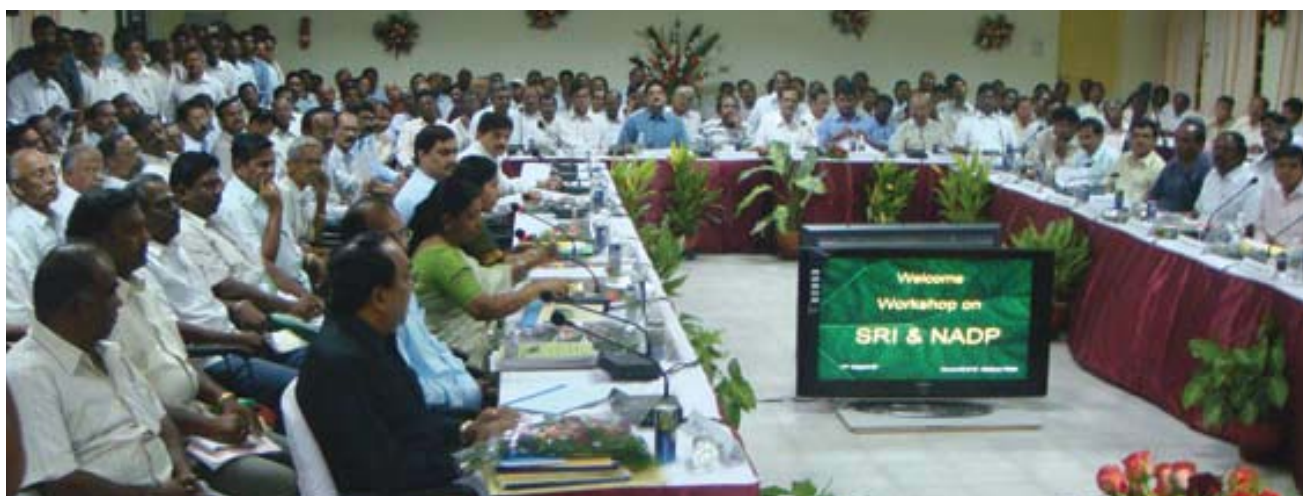
District Collectors from Tamil Nadu at the Workshop on SRI and National Agriculture Development Programme (NADP)

Continual visits by the Hon'ble Agricultural Minister, Members of Legislative Assembly, Secretaries to the Govt., Govt. officials, and the overwhelming positive responses from the farming community paved the way for