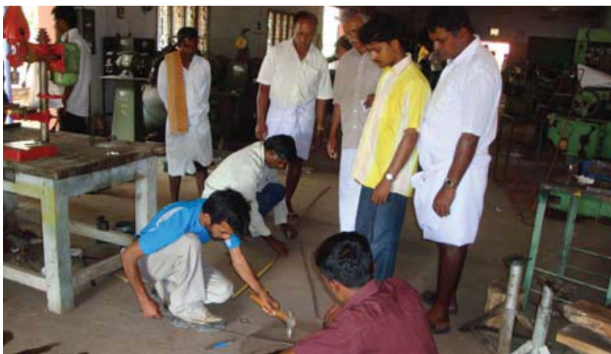
Training was organised for 1000 rural artisans on SRI implements