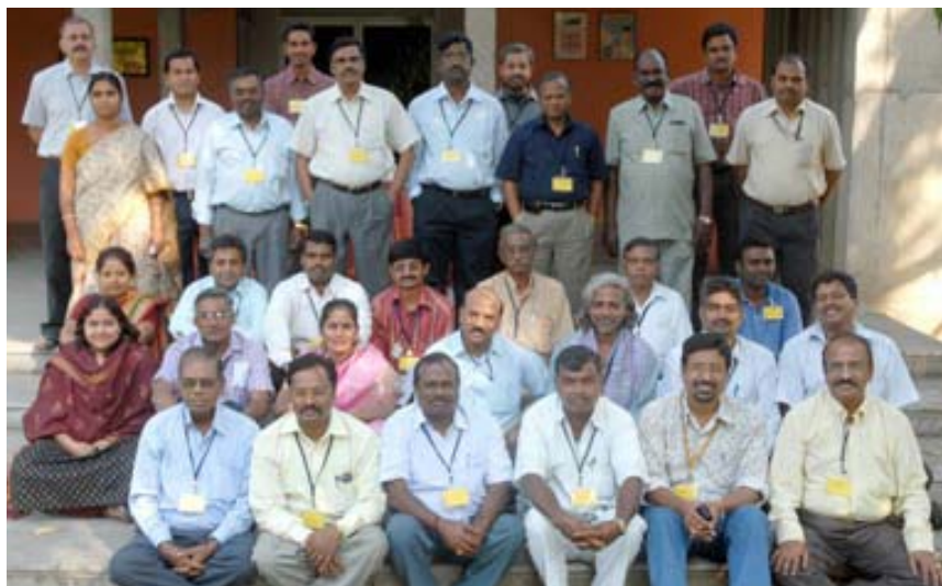
Participants of SRI meeting at ICRISAT