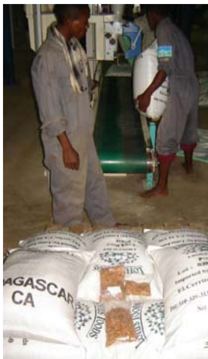
Pink rice that was grown by SRI farmers being milled and put into Lotus Foods bags destined for California.

Another goal was to launch three SRI-grown rice products under the Lotus Foods